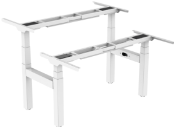
Dual Benching Height Adjustable Frame Only - DHADW / DHADB