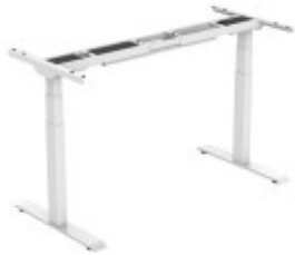
Height Adjustable Frame -3 Stage Dual Motor