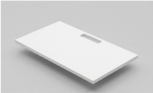
Melamine Table Tops