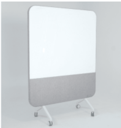
Movable Partition Screen